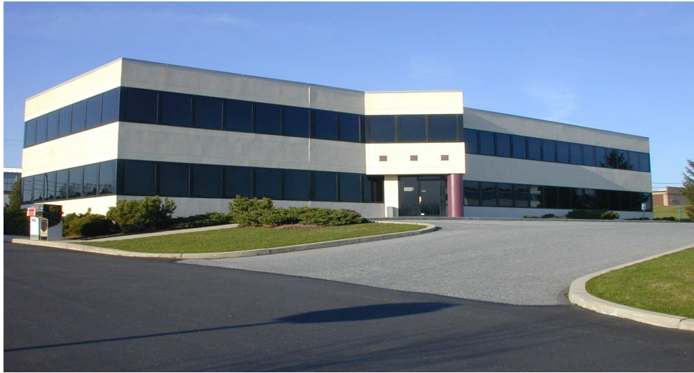
2148 Embassy Drive Lancaster, PA 17603